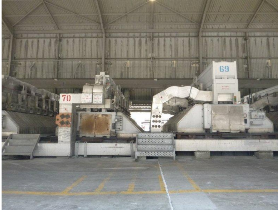
Figure 1. D18 pot (left) and the first D18+ pot (right) in the demonstration section of DUBAL Potline 1.

The successful and stable performance of these prototype DX cells led to the strategic decision to invest in the construction of a demonstration potline of 40 cells, known as Potline 8, which was commissioned in 2008 at 340 kA, and reached 402 kA in February 2015.