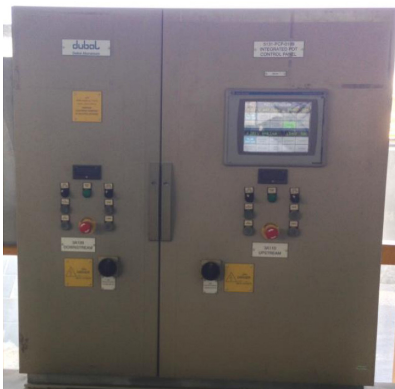
Figure 5. Integrated pot control panel (IPCP) for two cells in EMAL Potline 3.

All the development work is supported by an in-house team of approximately 45 engineers, modelling experts, software developers and technicians. The team includes experts with international experience gathered over many years as well as new local engineers who have been appointed to maintain the momentum of developing new technologies. The team has project management capabilities to package the technology for transferring the same to external clients.