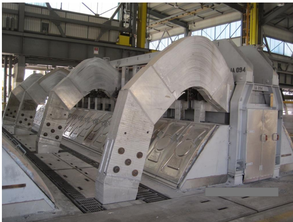
Figure 2. DX cell in EMAL Potline 1.