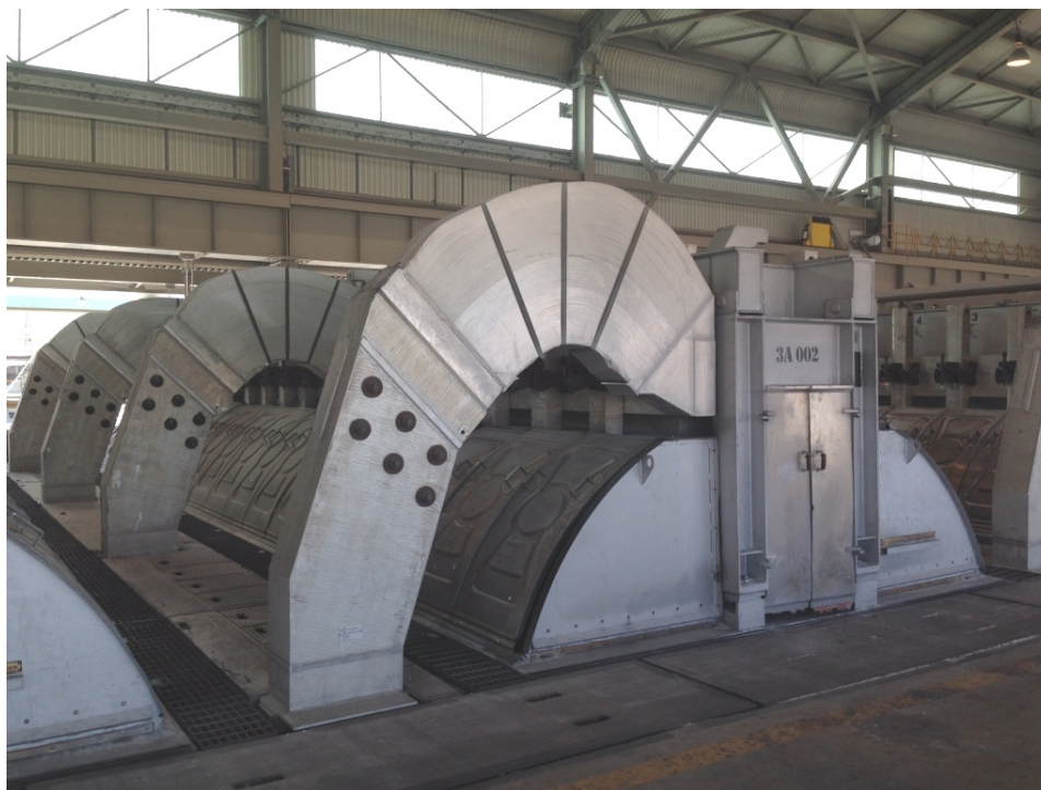
Figure 3. DX+ cell in EMAL Potline 3.